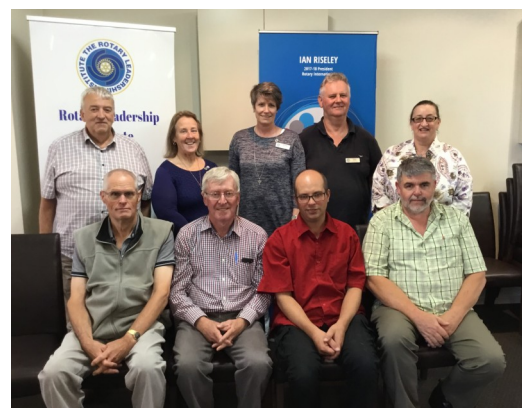
RLI 3 IN MT GAMBIER FEB 3RD