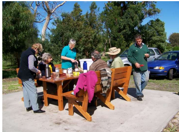
Friends of the park working bee

The Rotary Club of Millicent thanks all those organisations, businesses and people who have helped in any way in the Park development.